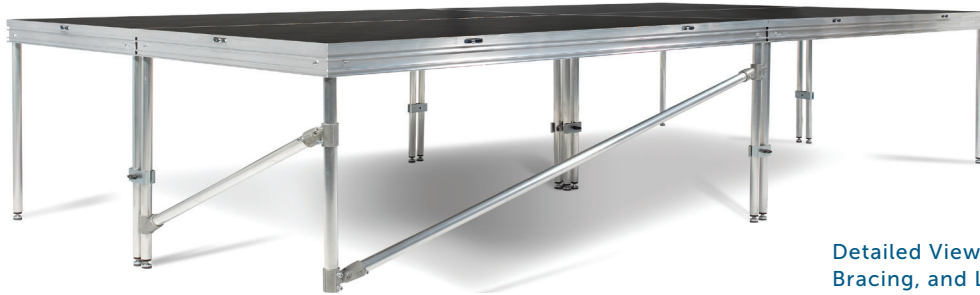
Detailed View of SC90 Leg Supports, Bracing, and Leg Clamps