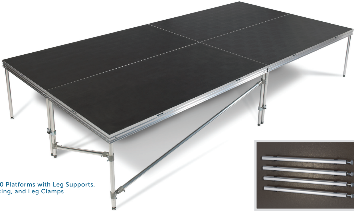
SC90 Platforms with Leg Supports, Bracing, and Leg Clamps

Our SC90 Leg Supports, used with the SC90 and SC97 Platforms, guarantee maximum durability and strength; the leg supports feature the same high quality aluminum that is used on our platforms. The leg supports are available in both fixed and adjustable heights, and have bracing and leg clamps available for extra stability and rigidity at higher elevations. In addition, our leg supports can be used with the most challenging custom applications on stages, seating and choral riser systems.