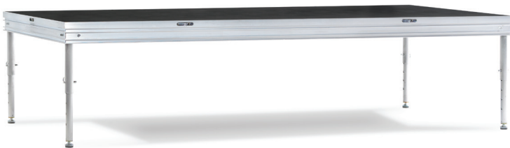
SC90 Platform with SC90 Adjustable Leg Supports